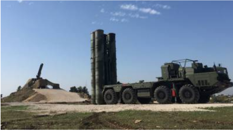
Russia S-400 deployed in Syria

While the broader public was led to believe that a major confrontation between Russia and the US-led coalition was imminent, with potentially devastating consequences, a handful of officials in the upper echelons of the US, UK and French governments were privy to the precise details and timing of the bombing operation against Syria which took place after the closing of the World's stock markets on Friday evening, April 13 (ET). They had advanced knowledge that a confrontation between Russia and the US-led Coalition forces would not take place.