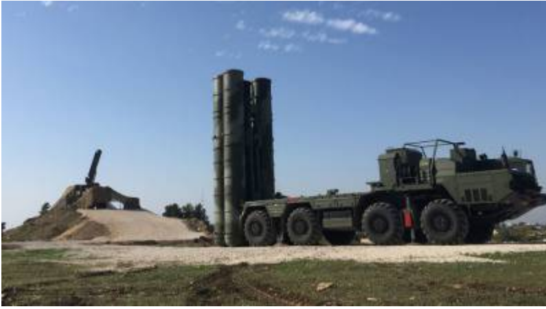
Russia S-400 deployed in Syria

While the broader public was led to believe that a major confrontation between Russia and the US-led coalition was imminent, with potentially devastating consequences, a handful of officials in the upper echelons of the US, UK and French governments were privy to the precise details and timing of the bombing operation against Syria which took place after the closing of the World's stock markets on Friday evening, April 13 (ET). They had advanced knowledge that a confrontation between Russia and the US-led Coalition forces would not take place.