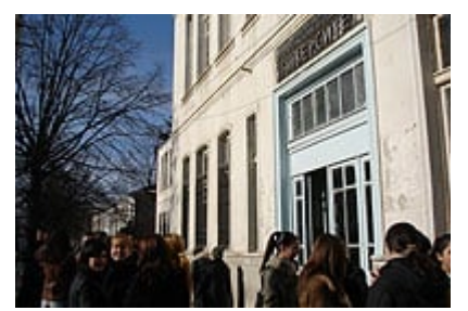
Tskhinvali's University before the bombing

The Russian response was entirely predictable.