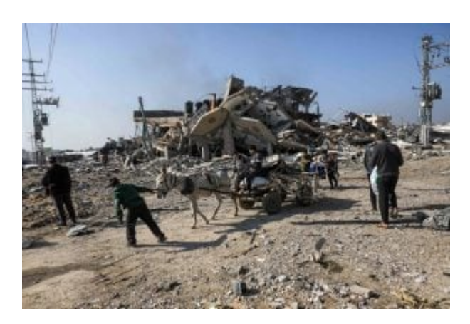
Image: The UN says nearly 1.9 million people have now been displaced in Gaza.

Undoubtedly, the era of intermittent cycles of fighting and cease-fires in Gaza is Over. There will be no going back to the previous state of affairs. For both the Palestinian Resistance and