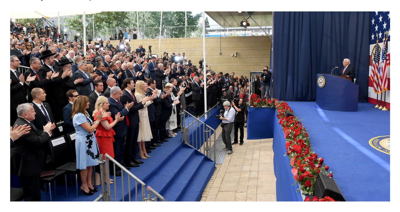
Benjamin Netanyahu, Jared Kushner and Ivanka Trump attending the opening of the United States Embassy in Jerusalem (Licensed under CC BY 2.0)

In effect, in May 2018, Friedman, Kushner, Netanyahu and nearly a thousand guests gathered in Jerusalem for the official ceremony marking the move of the US Embassy. That same day, around 50 miles south, at the border with Gaza, tens of thousands of Palestinians had gathered to protest the embassy move and Israel's blockade. Hamas urged protesters to break through the border fence. Israeli soldiers responded with rifle fire killing more than 60 people. "What the embassy move symbolised to Palestinians was that they were not going to have a state with its capital in Jerusalem, because now the President of the United States had said that only Israel had a legitimate claim to Jerusalem, and that it would remain eternally Israel's capital." [6]