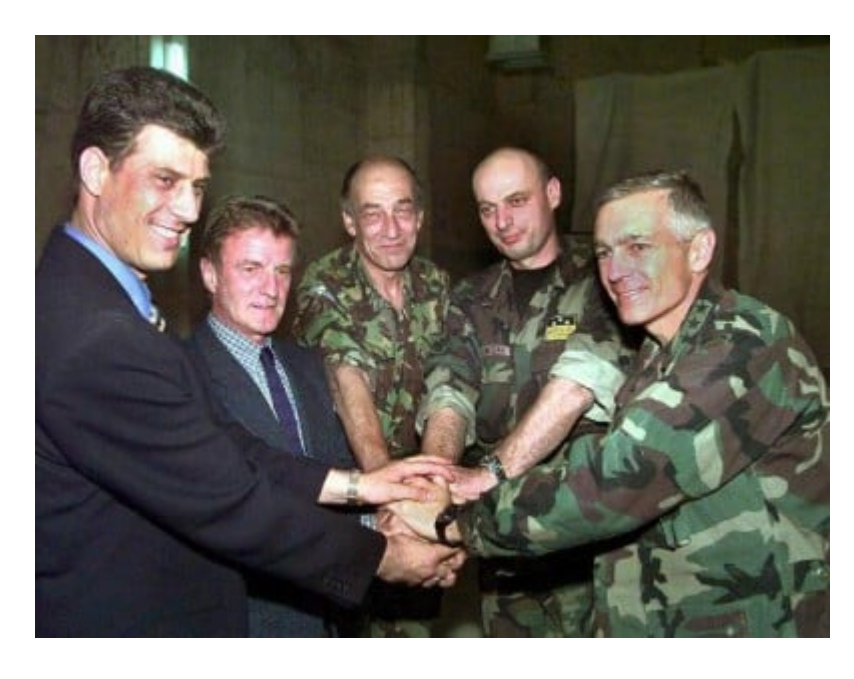
1999 War Criminals Join Hands (Kosovo 1999).

In turn, Military Professional Resources Inc (MPRI) , a mercenary outfit on contract to the Pentagon was responsible for advising the Croatian HVO forces in the planning of "Operation Storm". The same mercenary outfit was subsequently put in charge of the military training of the Kosovo Protection Corps (KPC) largely integrated by former KLA operatives.