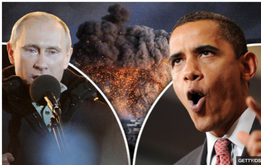
GET READY: Alaska residents told to prepare for Russian invasion