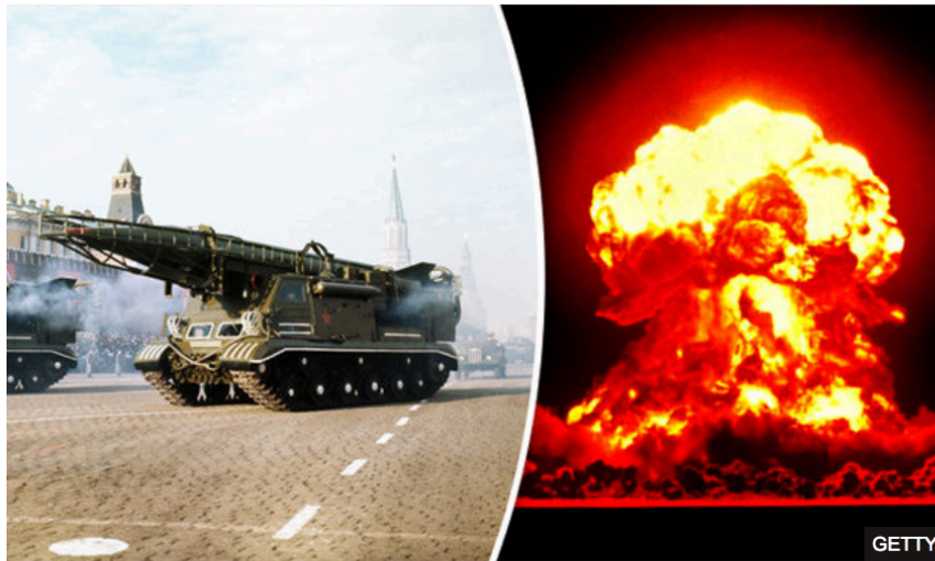
UPGRADED: The US is getting closer to nuclear war, it has been claimed

By Joshua Nevett / Published 14th October 2016