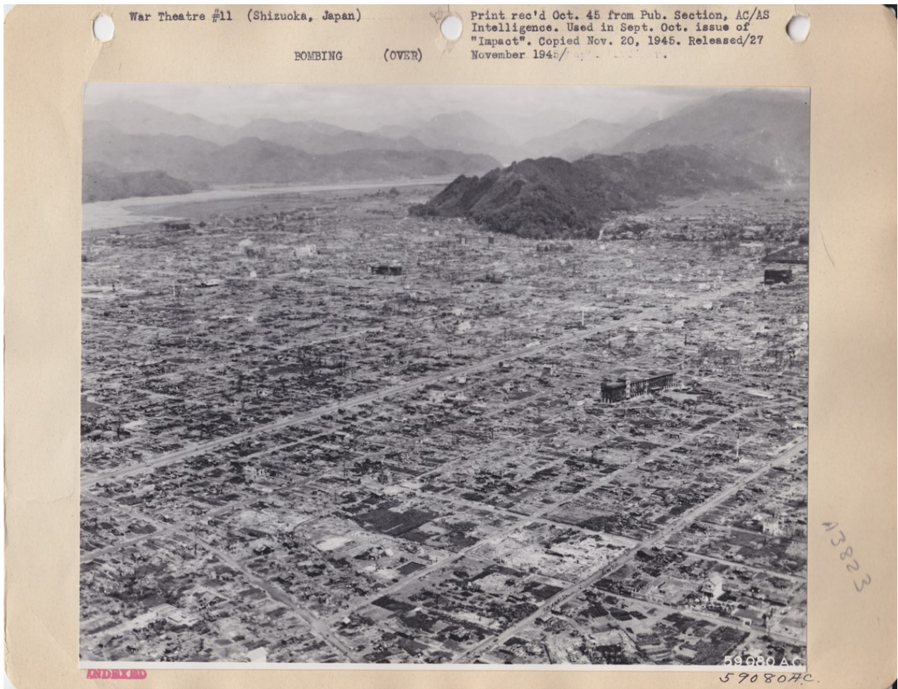
Part of Shizuoka after it was bombed on 19 June 1945.

In our study, we calculated how much smoke was emitted based on estimates for the area burned by fires, the amount of fuel, how much soot was emitted into the upper troposphere and lower stratosphere, and how much was washed out by rain.