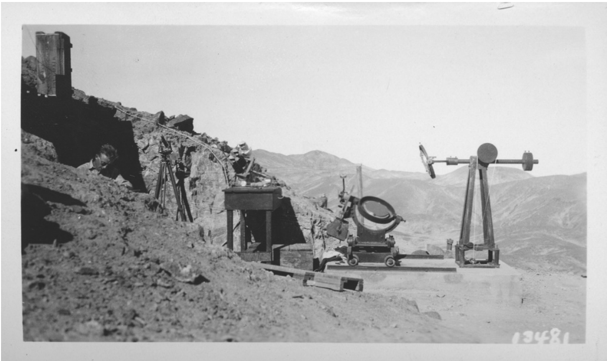
The solar irradiance observatory at Mt. Montezuma, Chile.

For global land surface temperature records, we used GISTEMP from NASA and CRUTEM from the Met Office Hadley Centre and the Climatic Research Unit at the University of East Anglia.