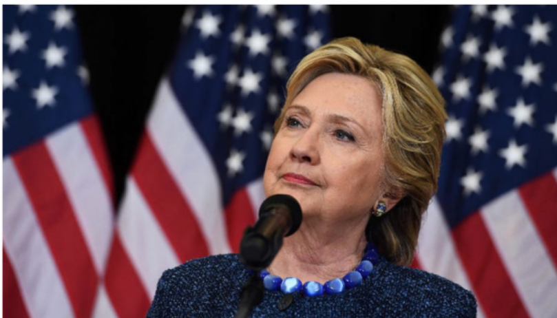
Hillary Clinton answers questions about the FBI reopening a probe into her use of a private email server on Oct. 28, 2016.