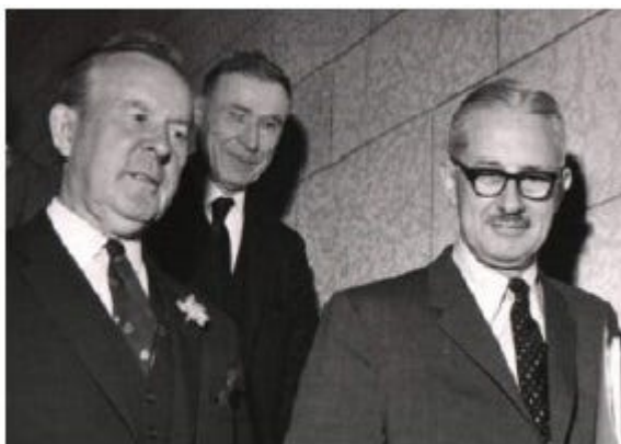
Lester Pearson and his sometimes controller Walter Gordon in 1963 entering the Commons.

During this time, Gordon was fully in control of Lester B. Pearson, having taken Pearson’s leash from Vincent Massey in the 1950s. Gordon had organized Pearson to head the Liberal Party ever since 1949, writing to Pearson in 1955 that “I have a feeling that people would like to follow your star in droves- if and when you decide the time is right to give them the nod.” (2). Before even becoming a member of the Liberal Party, Gordon even paid for a large scale Nobel Prize gala in Pearson’s honour from his own pocket in 1958 (3).