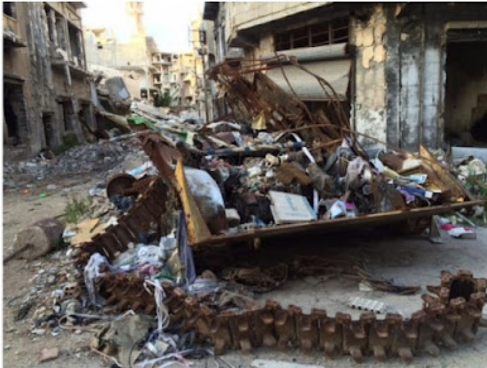
Image: Remains of a Syrian Army tank