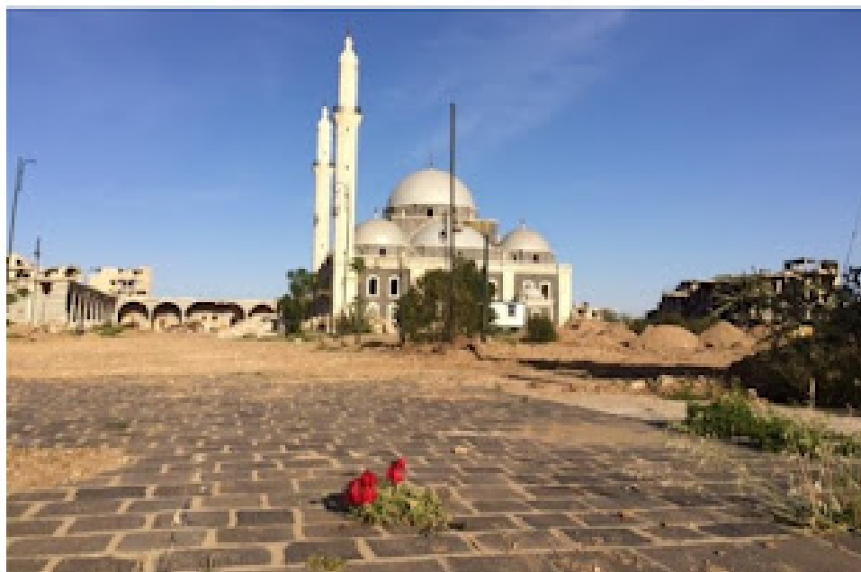
Image: Spring flowers, a symbol of hope in Homs

“This Accommodation Centre serves 5,000 IDPs who arrived on 16 March. The Government made this and other Centres available. Many NGOs are working here, together with the Ministry of Social Affairs, the Syrian Red Crescent, UNICEF and ICRC. The Syrian Army provides security and the Ministry of Education provides education. This is only a temporary stay until the people can return to homes. They are here while we check their records. If any are found to have a bad record, we discuss their details and we are working on reconciliation. Many have homes which have been destroyed. Work is being undertaken to rebuild them.”