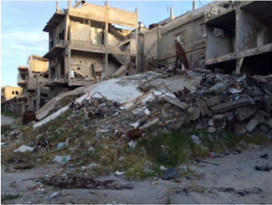
Image: Destruction in Homs