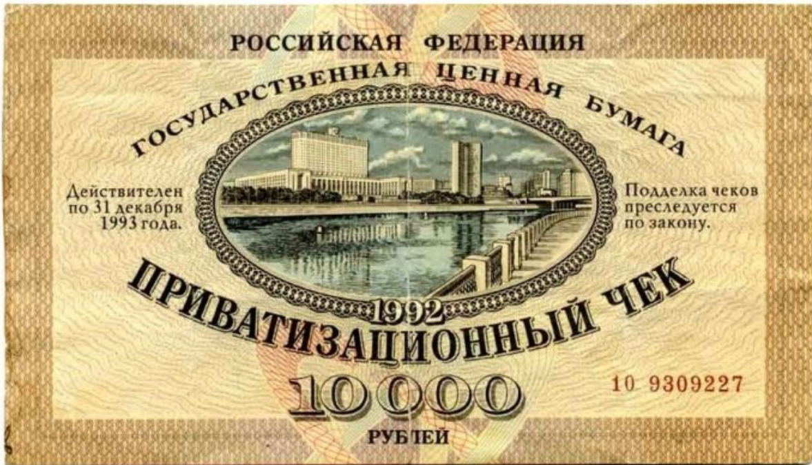
Privatization voucher