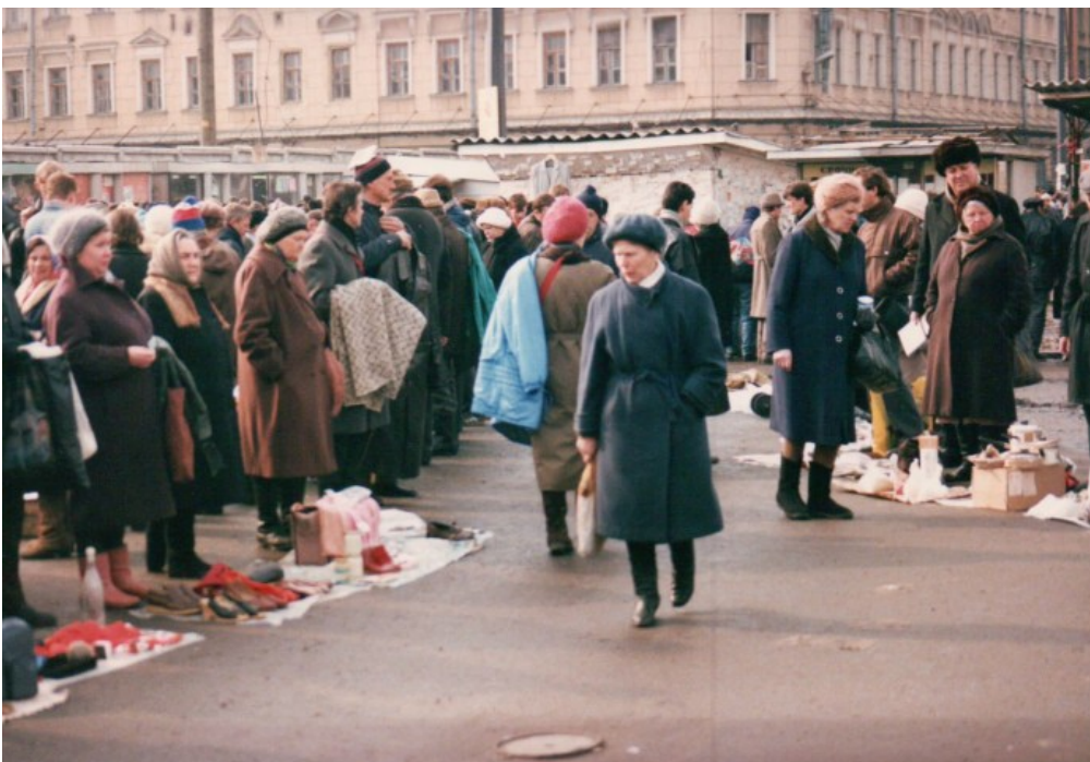
A street flea market in Rostov-on-Don, 1992.

According to these authors, Putin is popular because he guarantees a certain stability for the elites, oligarchs, civil servants and other powerful sectors of Russian society. Many ordinary Russians furthermore recall the economic devastation of the Yeltsin era, and connect Putin with the economic improvements that have taken place since that time—even if certain hardships remain.