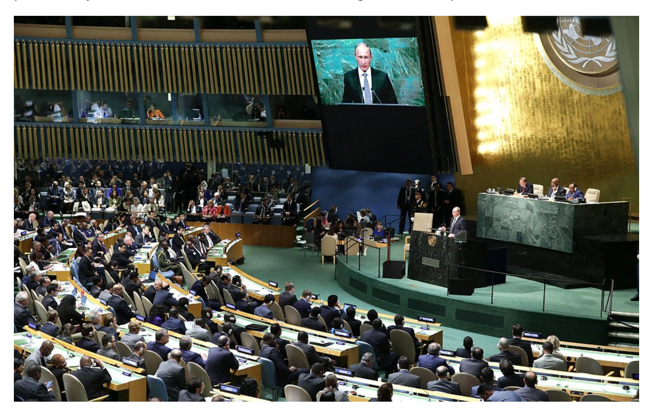
70th session of the UN General Assembly

Ladies and gentlemen, I have deliberately mentioned a common space for economic cooperation. Until quite recently, it seemed that we would learn to do without dividing lines in the area of the economy with its objective market laws, and act based on transparent and jointly formulated rules, including the WTO principles, which embrace free trade and investment and fair competition. However, unilaterally imposed sanctions circumventing the UN Charter have all but become commonplace today. They not only serve political objectives, but are also used for eliminating market competition.