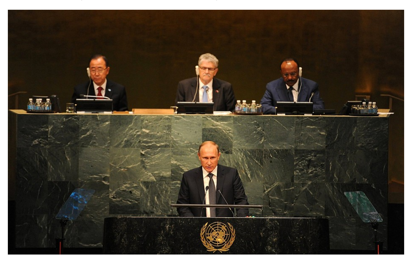
70th session of the UN General Assembly.

We all know that after the end of the Cold War the world was left with one center of dominance, and those who found themselves at the top of the pyramid were tempted to think that, since they are so powerful and exceptional, they know best what needs to be done and thus they don't need to reckon with the UN, which, instead of rubber-stamping the decisions they need, often stands in their way.