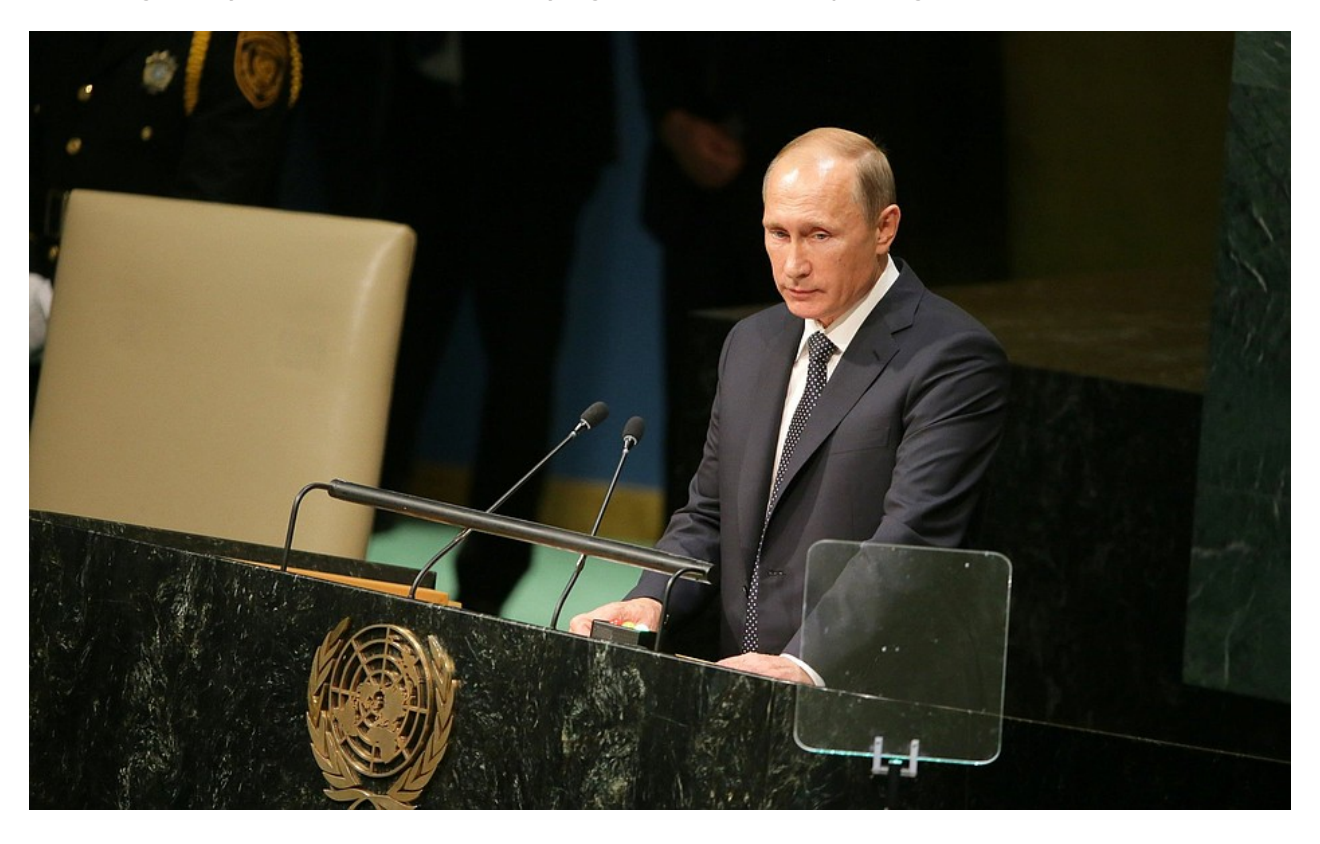
70th session of the UN General Assembly.

I would also like to address Muslim spiritual leaders: Your authority and your guidance are of great importance right now. It is essential to prevent people targeted for recruitment by extremists from making hasty decisions, and those who have already been deceived and, due to various circumstances, found themselves among terrorists, must be assisted in finding a way back to normal life, laying down arms and putting an end to fratricide.