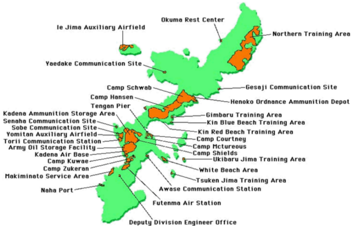
Map from the website of Okinawa Prefecture. Torishima, which is not shown on this map, is about 60 miles west of the Okinawa Island.