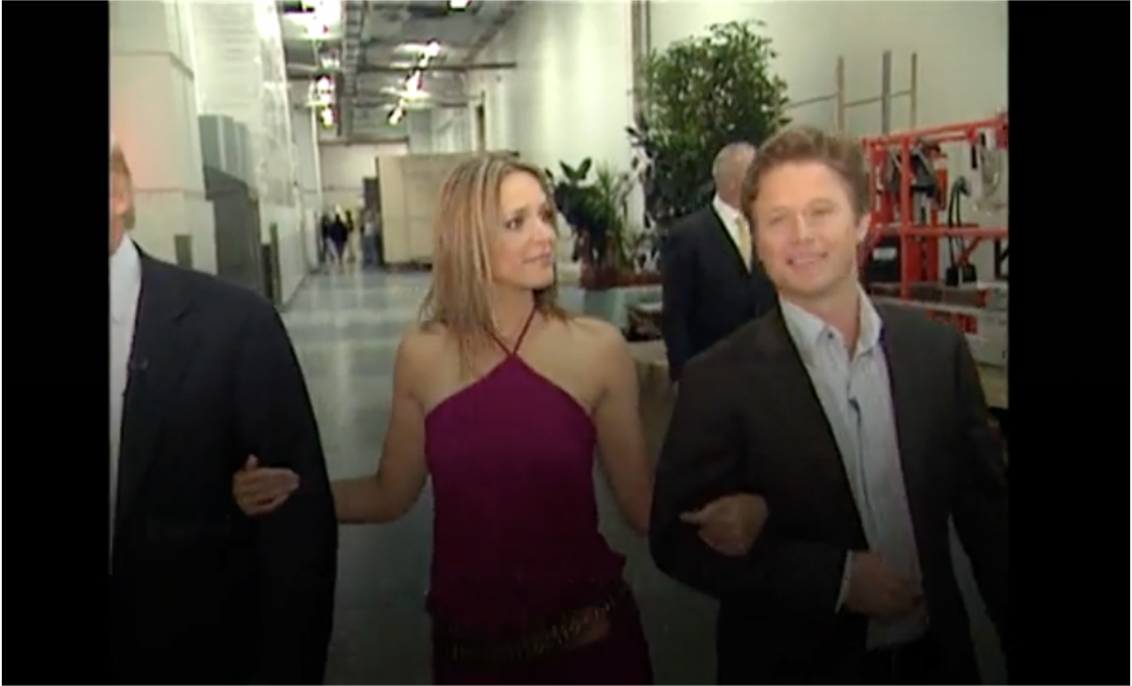
screenshot of Trump sexist-lewd video