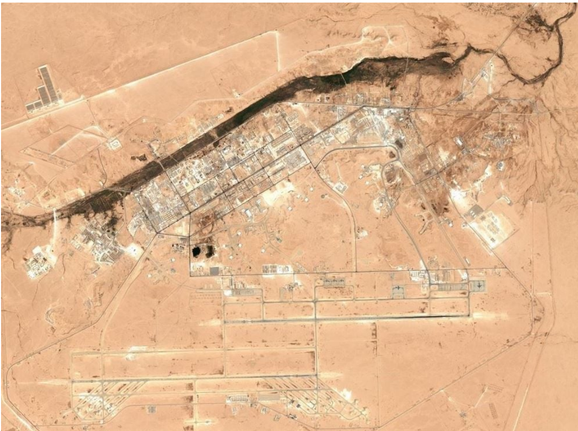
The Ayn al-Asad airbase.