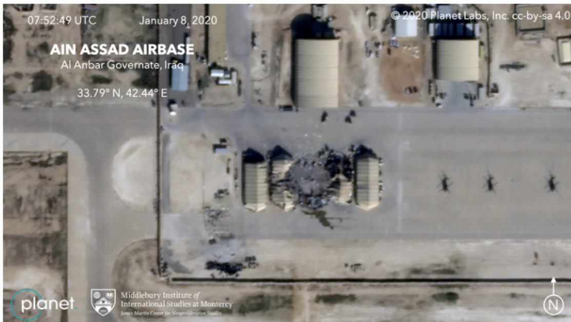
A satellite photo from the commercial company Planet shows damage to at least five structures at the Ain al-Assad air base in Iraq.