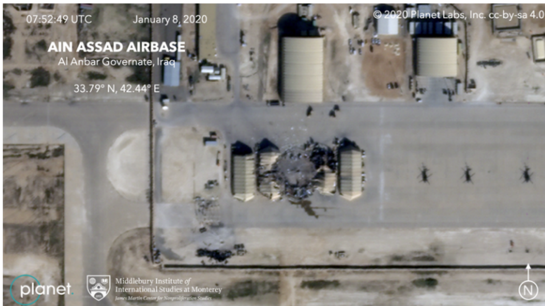
A satellite photo from the commercial company Planet shows damage to at least five structures at the Ain al-Assad air base in Iraq.