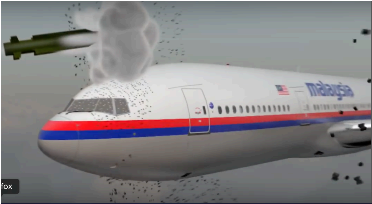
Screenshot from the video (below)

Simulation of the shrapnel which allegedly according to the DSB report created the perforations of the fuselage.