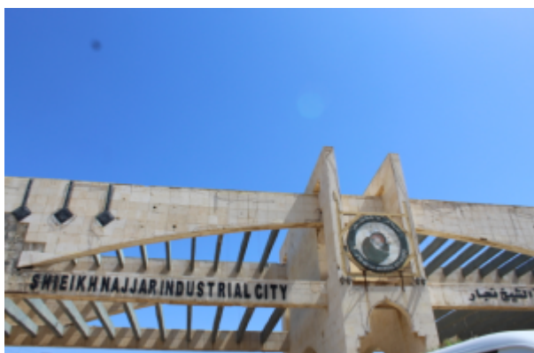
Image: Terrorist damage to Syria's industrial base, Aleppo, Syria

But I went also to Aleppo into this industrial park. Okay? It was in the [inaudible 00:19:16] of Aleppo. And I hope I don't make mistakes here, but if I do, I do. Anyway, we went to this industrial park and it was totally destroyed. And we sat down with some business people. And it was totally destroyed. And what happened was the terrorists, Western-supported terrorists, went in there and they stole... Everything that they could steal, they did steal and it ended up in Turkey, and everything else they destroyed. So the goal here is to help Empire destroy infrastructure, destroy the country, to weaken the country. And they're still doing it. Now Empire's openly stealing the oil. Trump said, yeah, I like oil. And they're openly stealing the oil. So Syria is a oil-rich country, but now with the sanctions, they have maybe one or two hours of electricity a day. Most of them, 80 or 90% are living in poverty, and they don't have enough oil resources. Why? Because it's being stolen. Why? Because Empire has imposed these unilateral, coercive measures called sanctions, they are criminal, that amount to collective punishment.