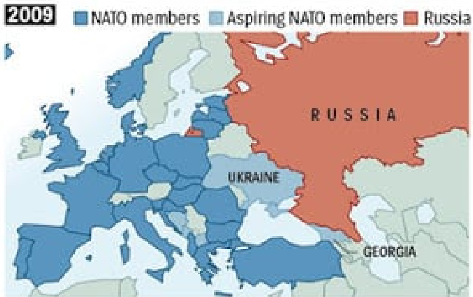
The Militarization of the EU. U.S Military Bases in the EU