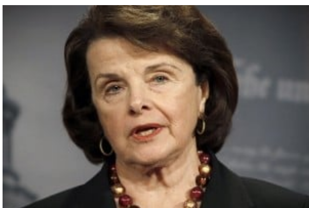
Senator Dianne Feinstein of California, sponsor of federal vaccine legislation

Is discrimination against conscientious vaccine objectors the only practical solution?