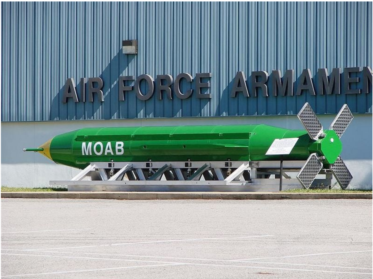
The Mother of all Bombs (MOAB)

“The MOP is described as ‘a powerful new bomb that aims straight at subterranean Iranian and North Korean nuclear facilities. The giant bomb –longer than 11 persons shoulder to shoulder, or more than 6 metres from end to end’.”