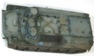
#9 - MT-ЛБ, какой-то из ранних вариантов. заметны два квадратных люка, башенка справа по ходу движения.

While the RF probably needed to secure the river crossing for future operations, they have otherwise redeployed in the Kharkov Oblast, giving up positions in villages where there is no strategic advantage, the UAF attacks, knowing there is minimal resistance. This strategy allows more effective use of RF forces, while sparing civilian lives.