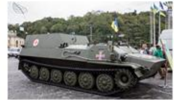
#10 - MT-ЛБ С, хорошо заметен прямоугольный отсек в задней части корпуса