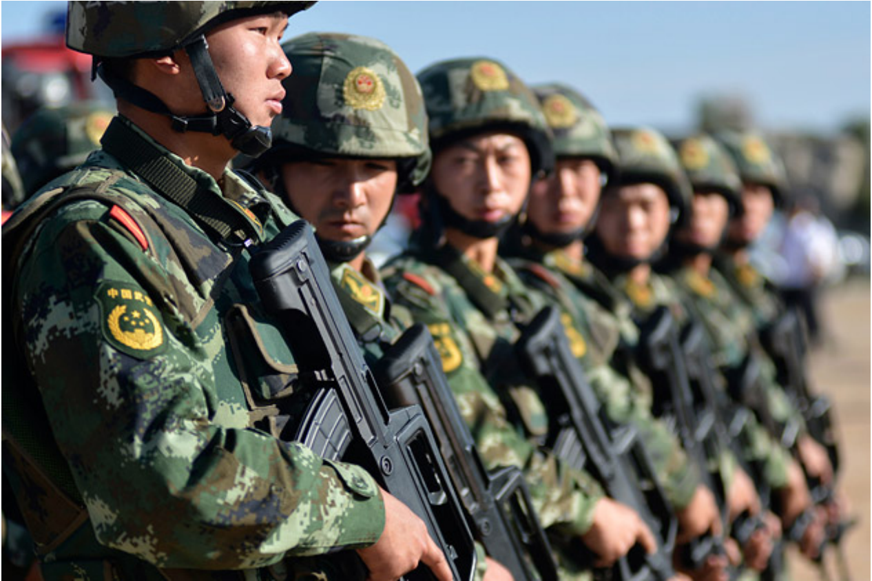
Image: A Russian-led multinational peacekeeping force placed along the 100 km border region facing off NATO troops in Turkey would not only put a final end to the Syrian conflict, it would wrest control of the West's self-proclaimed role as international arbiter over the world's affairs. Those who join the peacekeeping force would form the new face of a multipolar world order set to displace Wall Street and London's unipolar order.

It is a narrative that defies reason and logic, and also fails to address the ports of entry terrorists, funds, and weapons are entering into Turkish territory from before heading onward to Syria - likely because those are ports - seaports and airports - controlled directly by NATO and Ankara itself.