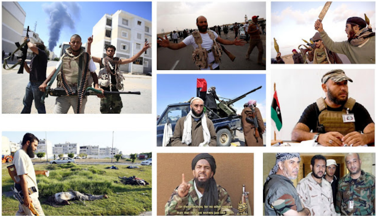
Image: “A lot of them were bald and many had beards. Many wore white sports shoes and army pants,” said an alleged “defected officer” of the perpetrators of the “Houla Massacre.” An apt description of the NATO-armed sectarian terrorists that ravaged Libya before traveling to Syria ( here , here , and here ) to continue their campaign of extremist-driven genocide . (click image to enlarge)

the south, are foreign fighters, armed by foreign sponsors, invading and conducting armed attacks on populated Syrian cities.