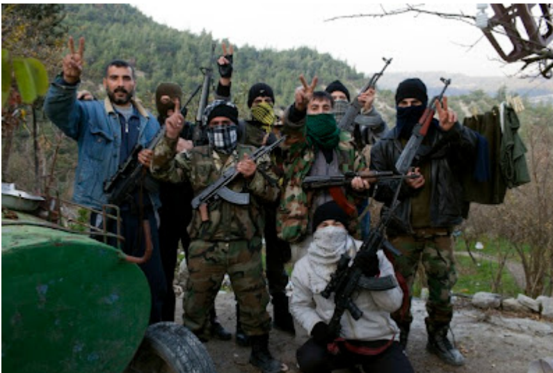
Photo: The “Free Syrian Army ,” whose composition consists of not only Syrian sectarian extremists, but Libyan terrorists from the US State Department listed “Libyan Islamic Fighting Group” led by Abdul Hakim Belhaj , is the manifestation of years of US, Saudi, and Israeli aid since at least 2007.

The Wall Street Journal (WSJ) in its article, “ Al Qaeda’s War for Syria ,” cited officials from the US Treasury Department stating, “Al Qaeda in Syria (often operating as the “Al Nusra Front for the People of the Levant”) is using traffickers—some ideologically aligned, some motivated by money—to secure routes through Turkey and Iraq for foreign fighters, most of whom are from the Middle East and North Africa. A growing number of donors from the Persian Gulf and Levant appear to be sending financial support.”