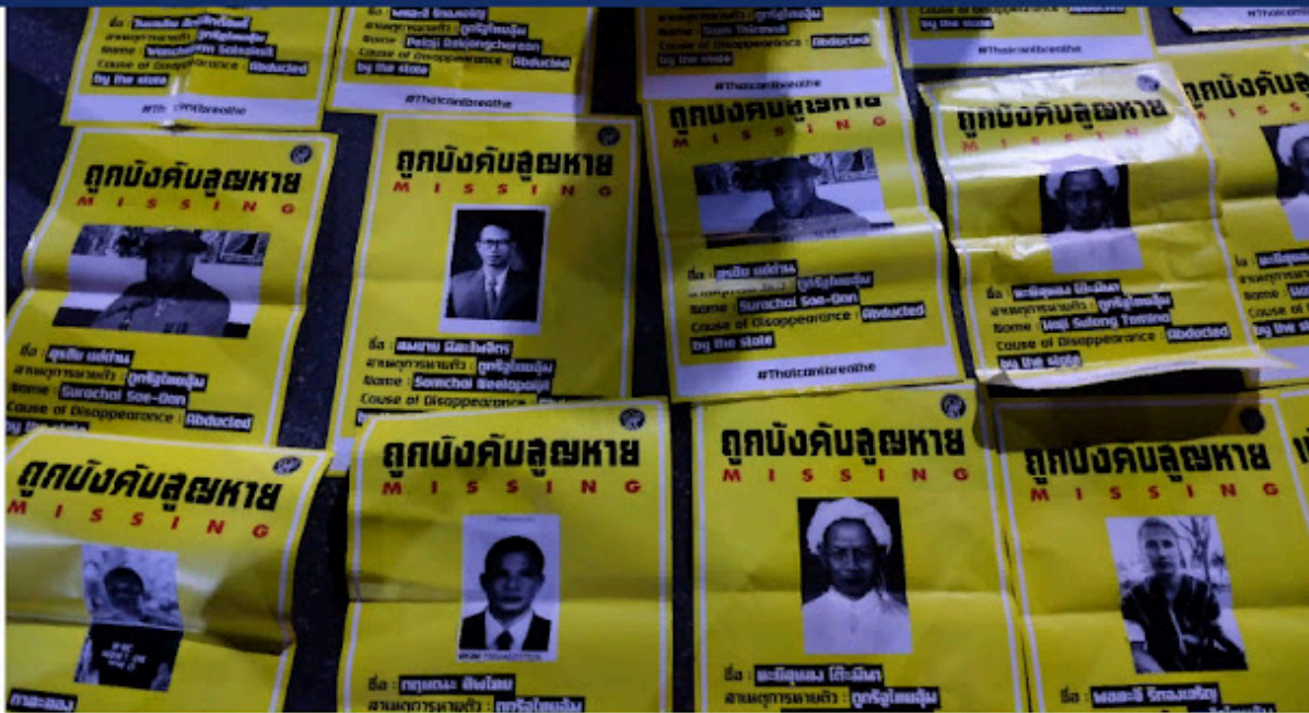
Posters of missing activists are displayed at the rally site.

The photo of the posters was courtesy of “Thai Lawyers for Human Rights” (TLHR). The Bangkok Post never mentions who TLHR is or that one of their members – Anon Nampa – is leading the current protests.