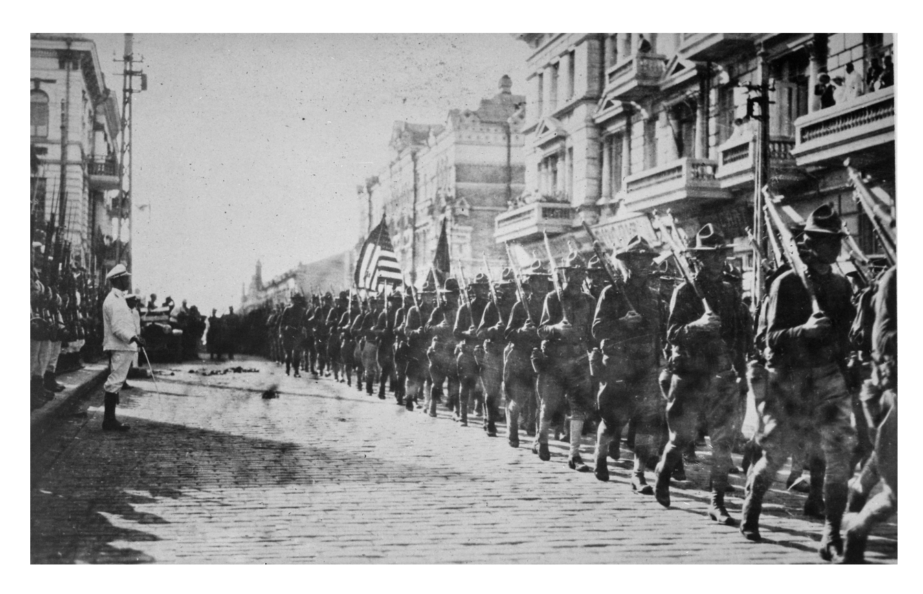
US Troops in Vladivostok in 1918

The US finally established diplomatic relations with the USSR in 1933 and an icy relationship has continued to the present. When Nazi Germany attacked the USSR in June of 1941, the US position was revealed by then U.S. Senator Harry Truman when he said: