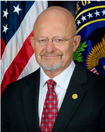
James Clapper, Director of National Intelligence.

Though it’s impossible for an average U.S. citizen to know precisely what the U.S. intelligence community may have in its secret files, some former NSA officials who are familiar with the agency’s eavesdropping capabilities say Washington’s lack of certainty suggests that the NSA does not possess such evidence.