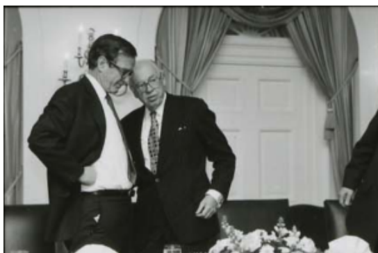
Then-Vice President George H.W. Bush with CIA Director William Casey at the White House on Feb. 11, 1981.

The U.S. intelligence community's handling of the Russian "hack" story also must be viewed in the historical context of the CIA's "politicization" over the past several decades.