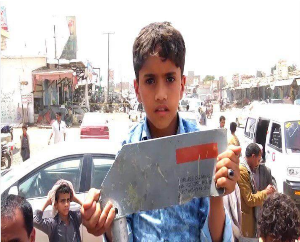
A child holds a fragment of the U.S.-made MK-82 bomb used in last Thursday's massacre of Yemeni schoolchildren.

However, U.S. complicity in last Thursday's bombing of a school bus goes far beyond merely providing the munitions used. Indeed, since this past June, the U.S. military has been providing the Saudi-led coalition "intelligence to fine-tune their [the coalition's] list of airstrike targets" in Yemen — meaning that the U.S. military was either, at worst, involved in choosing the strike location, or at the very least aware of the coalition's intention to target the school bus.