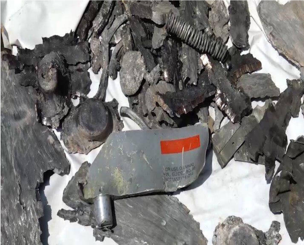
Fragments of the U.S.-made MK-82 bomb used in last Thursday's massacre of Yemeni schoolchildren.