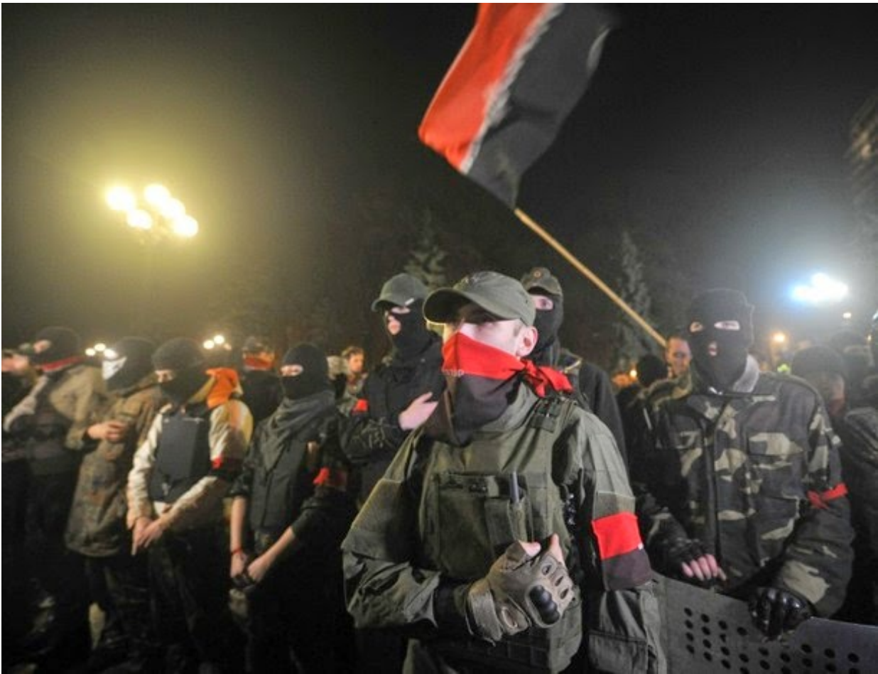
Image: While US State Department propaganda fails to confirm or deny the use of white phosphorus by Kiev against the people of eastern Ukraine, its propaganda does reveal that the vicious, heavily armed, Neo-Nazi Right Sector front is still operating across Ukraine and in direct cooperation with the regime in Kiev itself.

While few read “The Interpreter,” combing over its pages reveals a troubling reality. The overtly anti-Russian propaganda defending Nazis, the taking of journalists hostage, and the covering up of atrocities committed by the US-EU backed regime in Kiev is repeated almost verbatim across the rest of the corporate-controlled media in the West - from the BBC, to CNN, and across the pages of magazines like TIME and Newsweek. Few may read “The Interpreter,” but fewer still realize “The Interpreter” is the source of much of the lies echoed across the rest of the Western media about Russia, Ukraine, and other theaters where the West is fighting in to encircle, contain, and undermine Russia.