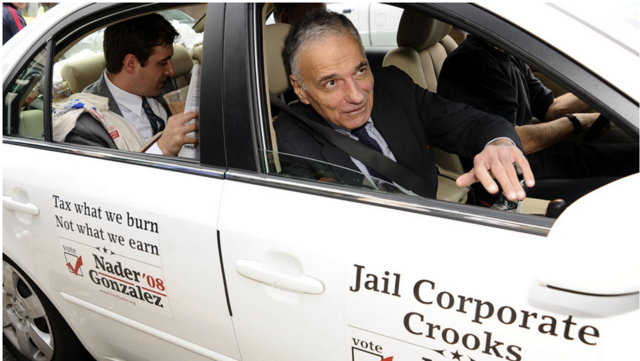
Ralph Nader in his campaign vehicle during his 2008 presidential bid.