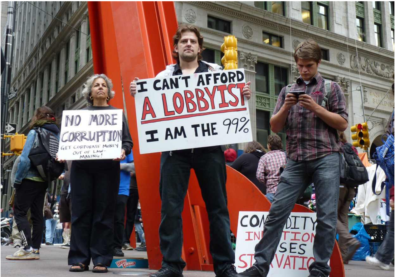
Occupy Wall Street protesters.

The role of corporate Democrats has been evident in the Democratic Party for a long time. The Democratic Leadership Council, founded by Bill Clinton, Al Gore and others, was successful at destroying Howard Dean , an insurgent, but definitely not a radical one. The DLC has evolved into the Third Way Democrats , whose donors are funding former Secretary of State Hillary Clinton and will seek to ensure the defeat of Sen. Bernie Sanders.