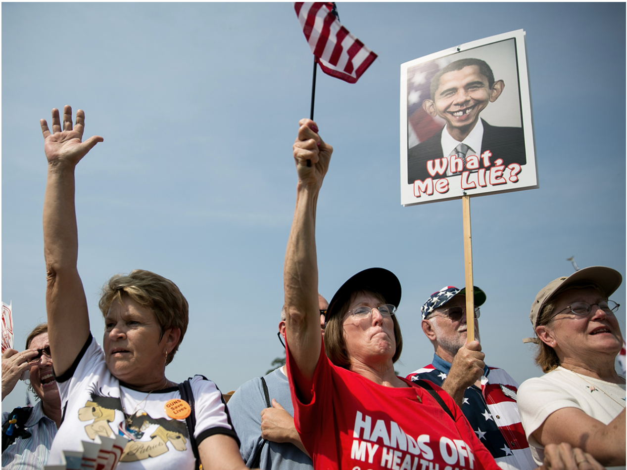
Tea Party activists cheer during the “Exempt America from Obamacare” rally, on Capitol Hill, September 10, 2013 in Washington, DC.