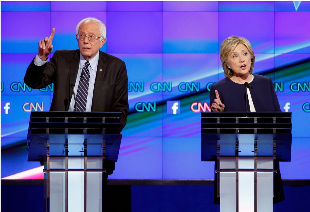
Hillary Rodham Clinton, right, and Sen. Bernie Sanders, of Vermont, speak during the CNN Democratic presidential debate Tuesday, Oct. 13, 2015, in Las Vegas.

Howie Hawkins, the recent New York Green Party gubernatorial candidate, writes in " Bernie Sanders is No Eugene Debs " that Debs, the five-time Socialist Party presidential candidate between 1900 and 1920, understood that it is essential for a movement to have its own political vehicle as a matter of principle. Hawkins recognizes that Sanders is good on most domestic issues (not as good on foreign policy) but: