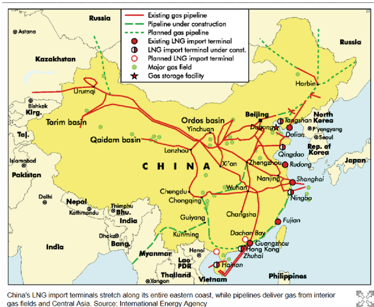
Figure 2: China's main gas supply pipeline corridors