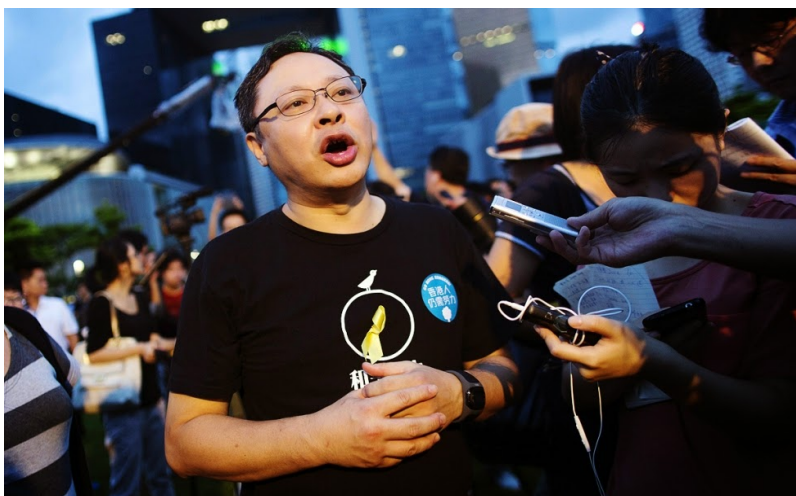
Image: Benny Tai, "Occupy Central's" leader, has spent years associated with and benefiting from US State Department cash and support.

It should be no surprise to readers then, to find out each and every "Occupy Central" leader is either directly linked to the US State Department, NED, and NDI, or involved in one of NDI's many schemes.