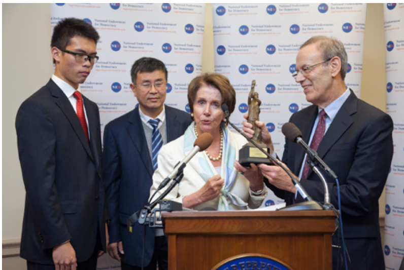
Image: The US through NED and its subsidiaries have a long history of promoting subversion and division within China.

– Earnest’s comments are verbatim the demands of “Occupy Central” protest leaders, but more importantly, verbatim the long-laid designs the US State Department’s NDI articulates on its own webpage dedicated to its ongoing meddling in Hong Kong. The term “universal suffrage” and reference to “Basic Law” and its “interpretation” to mean “genuine democracy” is stated clearly on NDI’s website which claims: