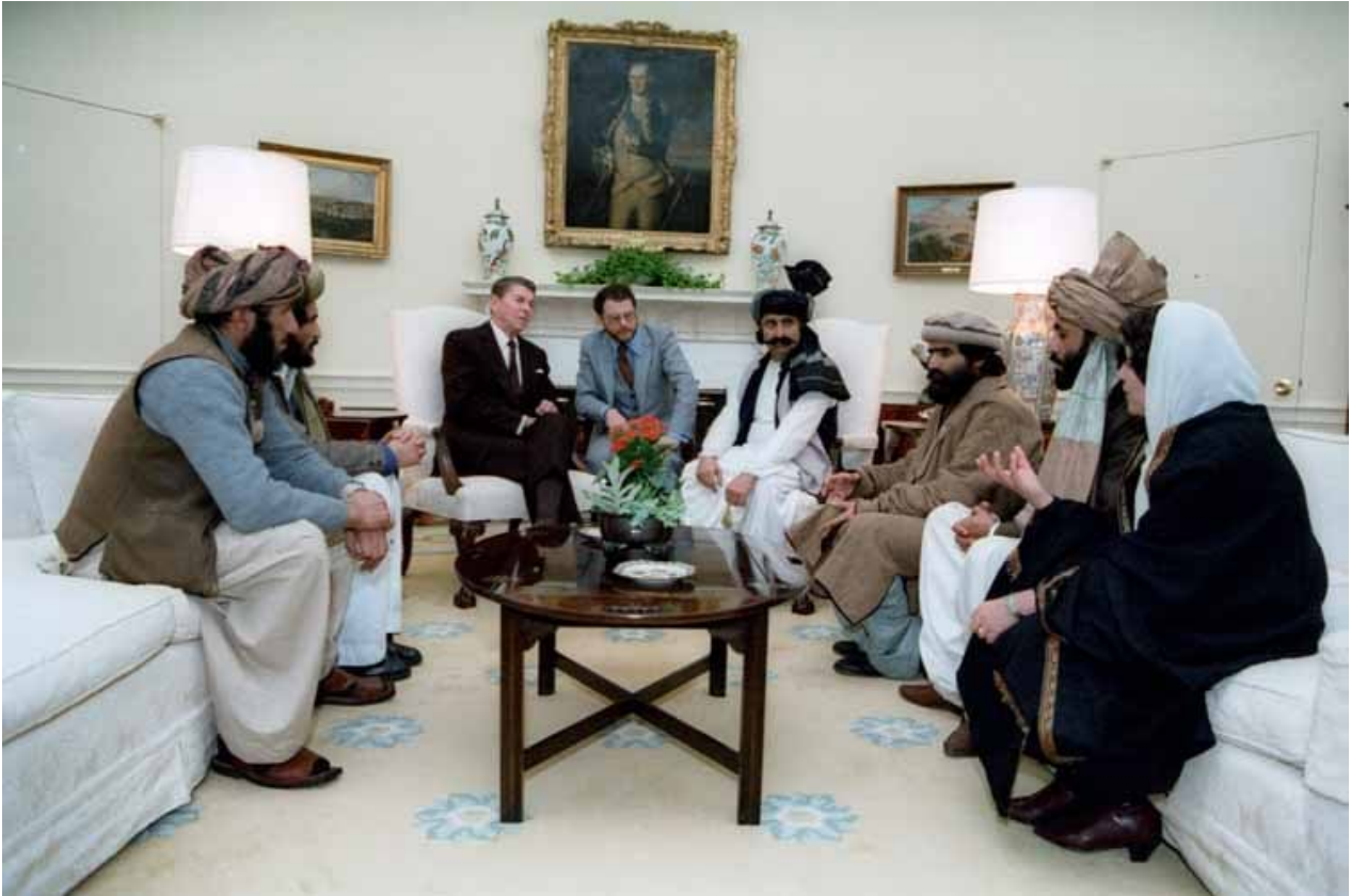
President Reagan Meets leaders of Afghanistan's Mujahideen at the White House (1980s)

Let us be under no illusions: The US has supported Al Qaeda and its affiliated organizations for almost half a century since the heyday of the Soviet Afghan war.