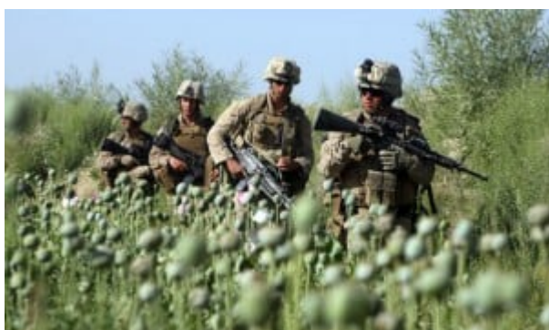
US troops in opium field in Afghanistan

This tactic worked very successfully in Afghanistan during the Cold War, when the Mujahideen forces serving the US were funded through drugs.