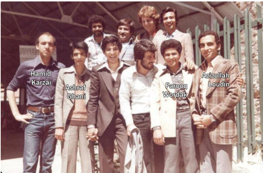
US education period