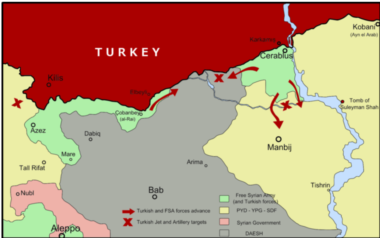
Map of the Turkish-led offensive in the northern Aleppo Governorate, showing the ongoing developments in west of Euphrates River.