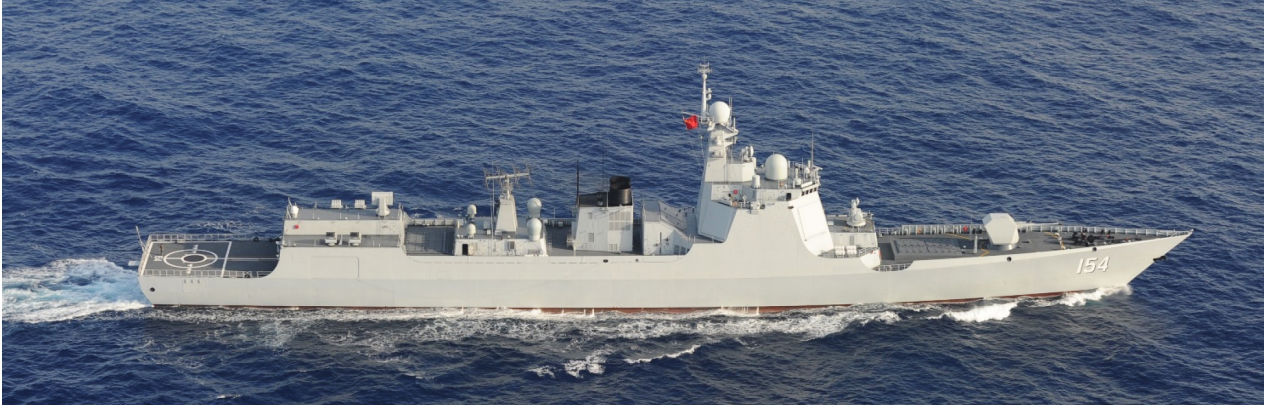
PLANS Xiamen (DDG-154) 20180420

They operate the world's largest merchant marine fleet with a total national flag tonnage of 294 million GT.