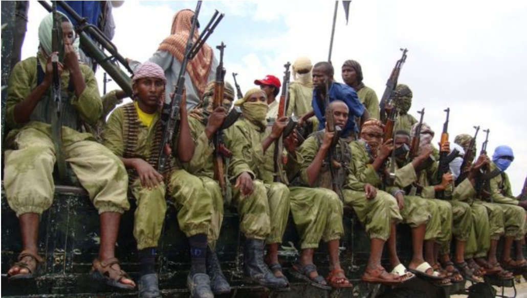
Somalia al-Shabaab fighters on transport truck

In recent years, the northern breakaway region of Puntland has seen drilling by the Canadian-based Africa Oil and Africa Energy corporations. This interest in oil and natural gas exploration are not confined to Somalia.