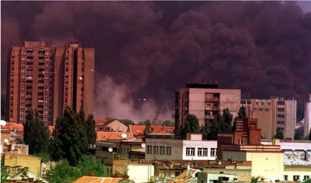
Novi Sad on fire, 1999 Federal Republic of Yugoslavia .

NATO's scope has also broadened into an intervention force, again under American auspices – one of the most glaring examples was the massive bombing campaigns against Yugoslavia in the late 1990s, during the Kosovo War.