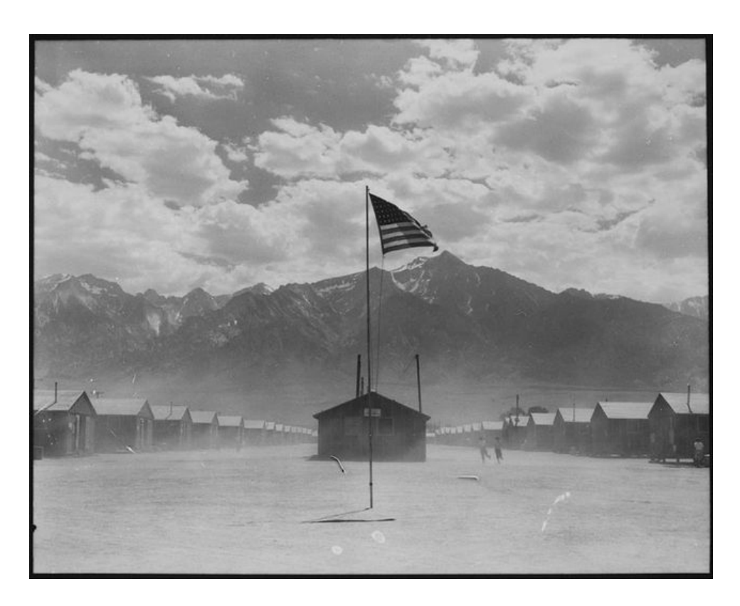
Manzanar Internment Camp, California

The military calls the new internment camp a "temporary emergency influx shelter," a dystopian echo of the US Army War Relocation Authority's decision to label Japanese internment camps "relocation centers."