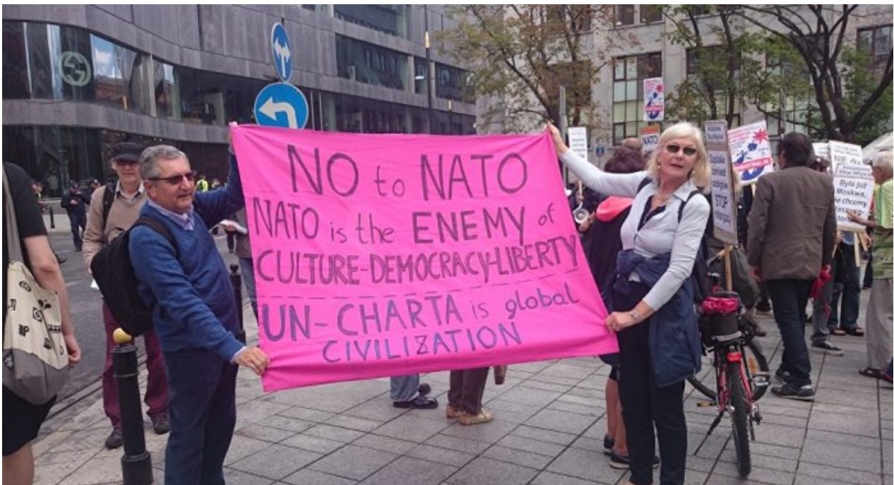
Anti-NATO protesters in Warsaw.

In Europe, massive protests were held during February in Berlin, Germany, over providing weapons to Ukraine in its war against Russia. Thousands took to the streets holding banners and posters saying ‘negotiate and not escalate’ and ‘not our war.’ Demonstrations also took place in London, Warsaw, Paris and other French cities such as Bordeaux, Rennes and Montpellier, and in Brussels, Belgium.