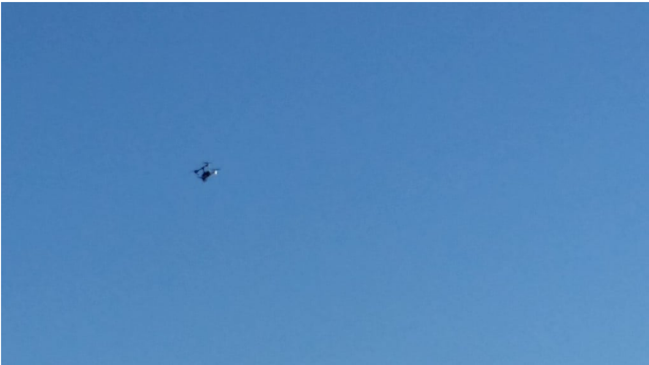
Drone watches from above.