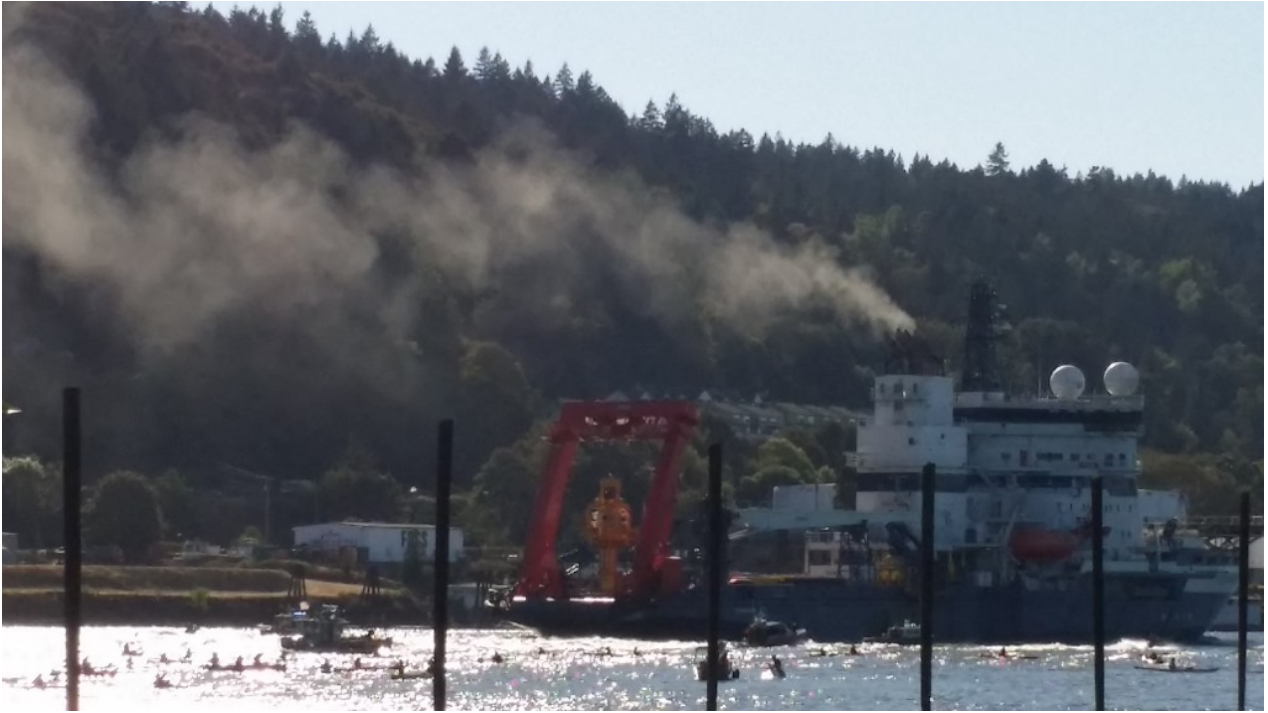
Gov.-escorted Shell rig spews exhaust after passing through cleared blockade.