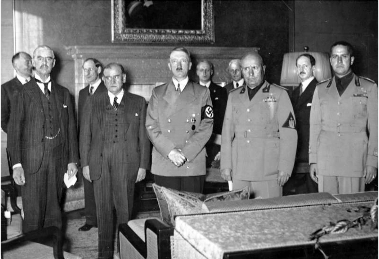
From left to right: Chamberlain, Daladier, Hitler, Mussolini, and Italian Foreign Minister Count Ciano, as they prepare to sign the Munich Agreement (CC BY-SA 3.0 de)

A few weeks after the Wehrmacht's March 1939 occupation of all Czechoslovakia, and despite increasing doubts about Western intentions, Stalin again approached the Franco-British powers. On 16 April 1939, he submitted a formal proposition: a three-power military pact with the obvious goal of deterring Nazi aggression (4). Stalin's diplomatic proposal mirrored the agreement in place prior to the First World War, in which Britain, France and Russia were bound together in an alliance directed against the German and Austro-Hungarian empires. Had Stalin's approach been accepted, it can only have changed the course of history - as such a union would have ensured, right from the beginning in the event of conflict, that Hitler faced a nightmare war on two fronts.