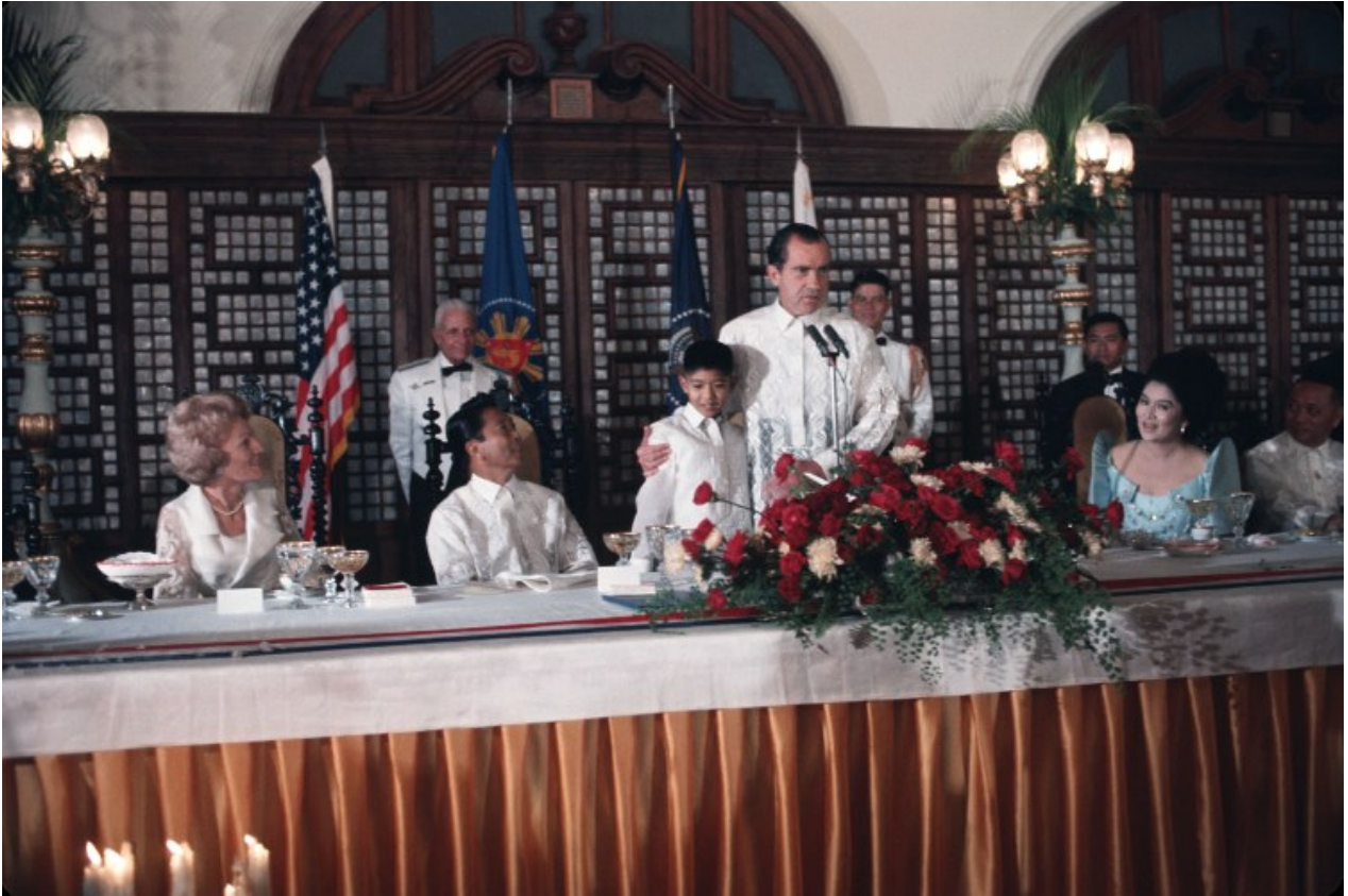
Marcos and Nixon