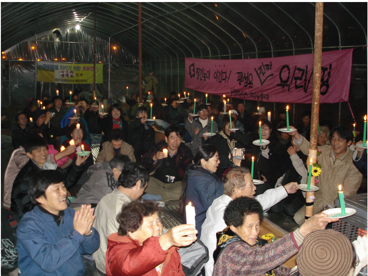
Farmers and supporters vigil, Pyongtaek

In South Korea, bloody battles between civilian protesters and the Korean military were waged in 2006 in response to US plans to relocate the troops there. In 2004, the Korean government agreed to US plans to expand Camp Humphries near Pyongtaek, currently 3,700 acres, by an additional 2,900 acres.