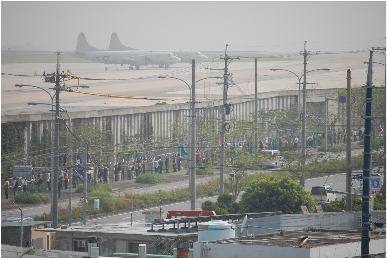
Demonstrators link hands encircling the US base at Kadena, Okinawa

Others focus on the purposes the bases serve, which is to stand ready to and sometimes wage war, and see the bases as implicating them in the violence projected from them. Most also focus on the noxious effects of the bases' daily operations involving highly toxic, noisy, and violent operations that employ large numbers of young males. For years, the movements have criticized confiscation of land, the health effects from military jet noise and air and water pollution, soldiers' crimes, especially rapes, other assaults, murders, and car crashes, and the impunity they have usually enjoyed, the inequality of the nation to nation relationship often undergirded by racism and other forms of disrespect. Above all, there is the culture of militarism that infiltrates local societies and its consequences, including death and injury to local youth, and the use of the bases for prisoner extradition and torture.[11] In a few cases, such as Japan and Korea, the bases entail costs to local treasuries in payments to the US for support of the bases or for cleanup of former base areas.