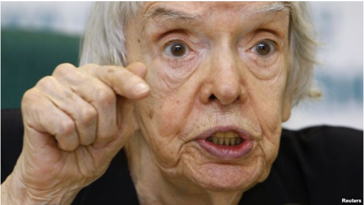
Image: Lyudmila Alekseyeva of the US State Department, Open Society Institute, USAID, NED-funded Moscow Helsinki Group claims, “this law has a despicable goal, which is to make it possible to say on television, ‘Look, they are admitting themselves that they are agents of foreign governments,’” leaving one to wonder, what should a foreign agent be called, if not a foreign agent?