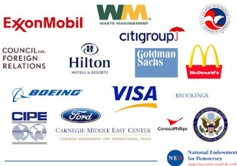
Image: A visual representation of the National Endowment for Democracy's corporate-financier ties found across their Board of Directors. Far from "human rights advocates," they are instead simply leveraging such issues to disguise what is in reality corporate-financier global hegemonic expansion.

The LA Times in fact, illustrates in their own article just how absolutely necessary this new legislation is. After claiming "the bills passed by Russia's State Duma are seen as the latest attempt to crack down on resistance to the rule of President Vladimir Putin," the Times goes on to cite the "Moscow Helsinki Group" (MHG) and their objection to the bill, never mentioning that it is in fact a direct recipient of US State Department money via the National Endowment for Democracy (NED) - and instead, merely states it receives "grants from abroad." In turn, the NED fails to properly inform the public of the corporate-financier interests, not human rights or "democratic" interests, represented throughout its Board of Directors.