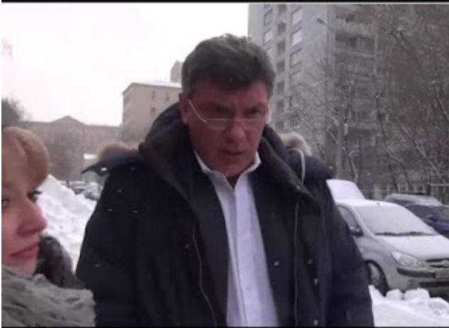
Boris Nemtsov - political opposition leader