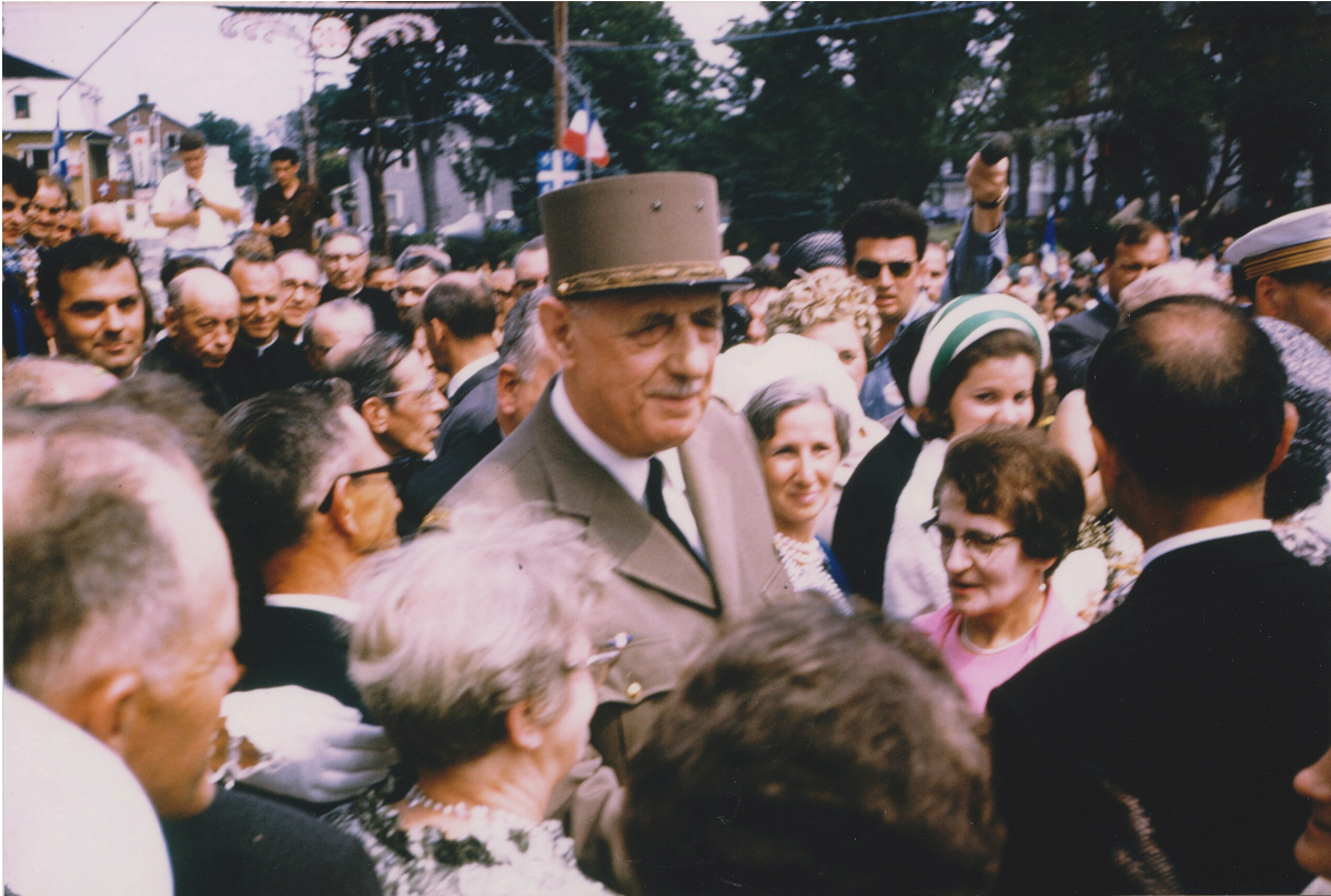
General Charles de Gaulle on the Chemin du Roy, Sainte-Anne-de-la-Pérade, 1967

Europe would be and is totally capable of building up her own defense forces, and I mean DEFENSE - not offense. And this outside of NATO.