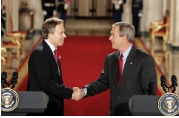
Tony Blair and George Bush after a White House press conference in November 2004

Despite the culpability of Western countries in spurring conflict and fomenting extremists, earlier this year Blair claimed religious extremism is at the root of 21-st century conflict and said a “global strategy” was needed to counter it. He also blamed the bloodshed in Iraq and Afghanistan on extremists, saying the coalition campaigns were “thwarted by religious extremism” in an attempt to exonerate himself.