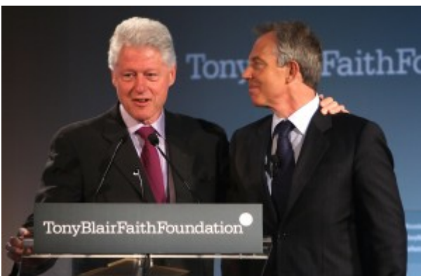
Bill Clinton with Tony Blair at the Tony Blair Faith Foundation launch.

The Tony Blair Faith Foundation: A Charitable Cover for a Global Agenda?