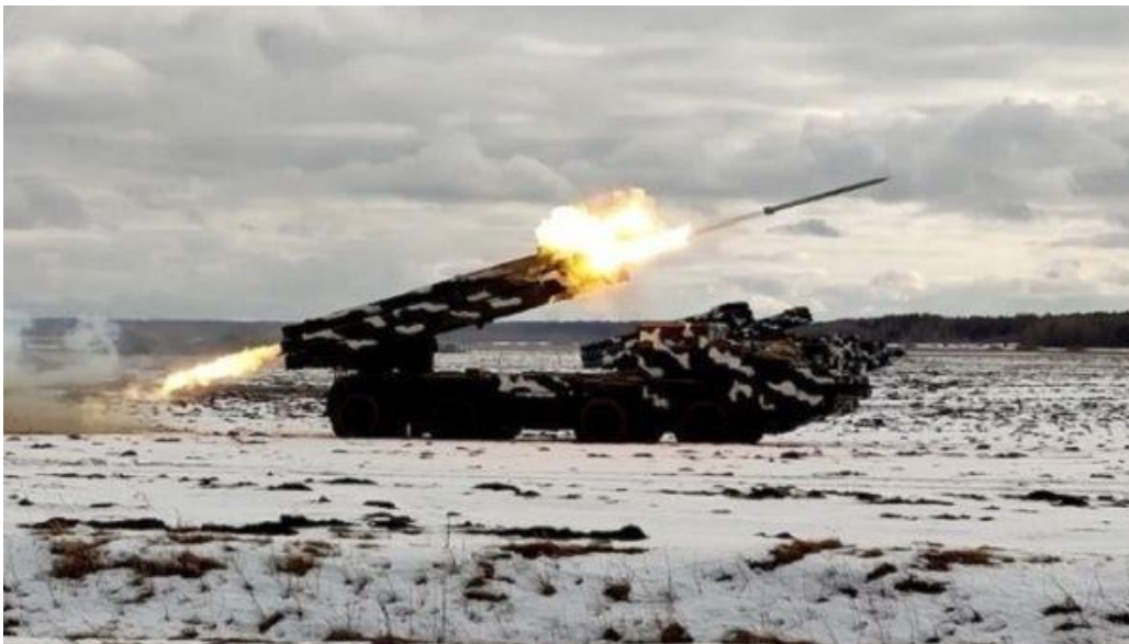
Shelling of Donetsk from Ukraine.

In 2014, the Ukraine Army started shelling Donbass in the east, killing 10,000 civilians, which is 10 times more than the UN-reported 1,000 civilians that Russia allegedly killed in 24 days since their incursion into Ukraine, February 24 to March 20.