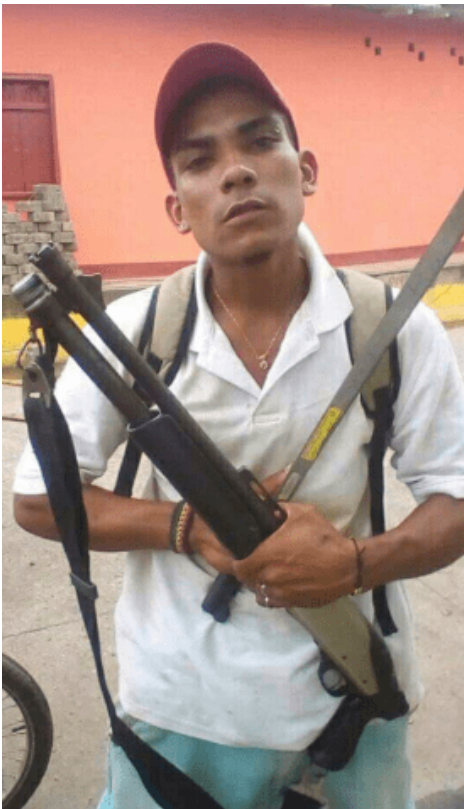
Image: Anti-Ortega demonstrator brandishing gun.

In making this assertion, the experts not only discount evidence of crimes by those arrested since 2018, but also ignore or downplay the many acts of clemency that took place, culminating in a general, conditional amnesty in 2019 that covered even the organizers of fatal attacks on police stations. The strong implication is that abuses such as “extrajudicial killings” which it alleges—on highly questionable grounds—occurred in 2018, still take place now in a country which is entirely at peace.