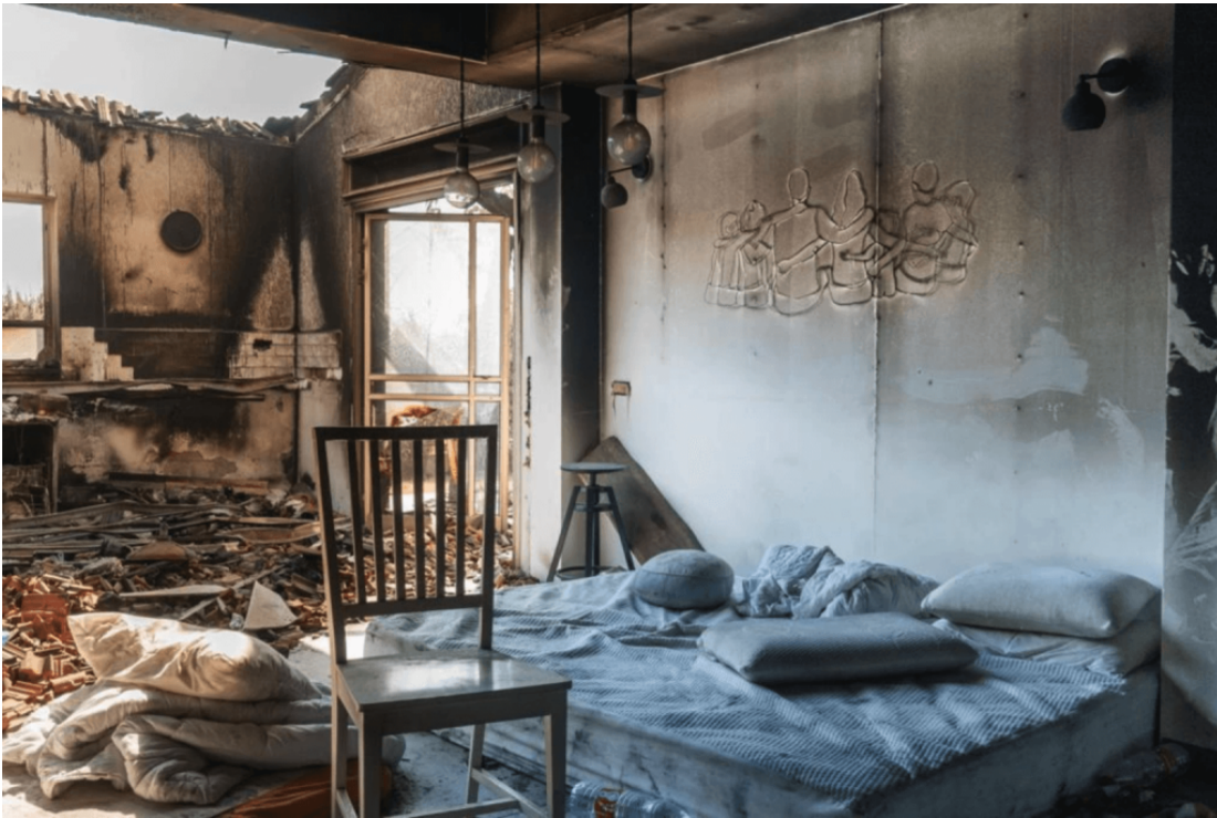
Photo released by the Israeli military from the events of October 7, 2023

Developments since October 7 has once again brought to the fore the centrality of the Palestinian question in the modern era. Even though the propaganda and psychological warfare aimed at defending the Zionist government reached new levels of depravity in the aftermath of the Al-Aqsa Flood, Palestine solidarity has grown by leaps and bounds.