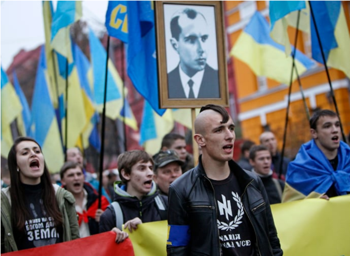
Neo-Nazi March in Kiev, portrait of Bandera

II, expecting a victorious Hitler to grant Ukraine independence from the Soviet Union.