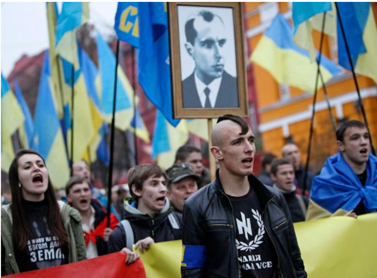
Neo-Nazi March in Kiev, portrait of Bandera

War II, expecting a victorious Hitler to grant Ukraine independence from the Soviet Union.