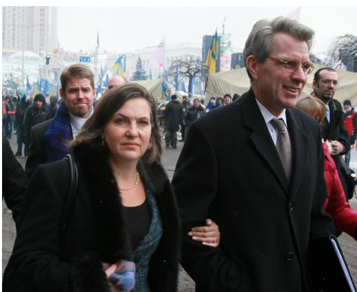
Nuland and Pyatt in Kiev

In fact, Clinton's Assistant Secretary of State for Eastern European Affairs, Victoria Nuland , personally kept up the rebellion's morale by handing out cookies in the Maidan encampments. When Yanukovich was forced to flee for his life, she chose his successor in consultation with then American Ambassador to Ukraine, Geoffrey Pyatt , in a telephone conversation which can be found on the web.