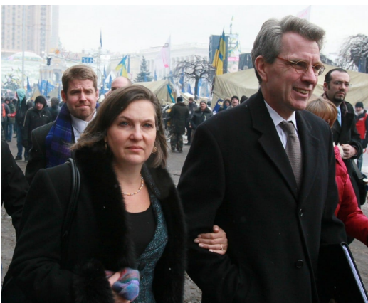
Nuland and Pyatt in Kiev

In fact, Clinton's Assistant Secretary of State for Eastern European Affairs, Victoria Nuland, personally kept up the rebellion's morale by handing out cookies in the Maidan encampments. When Yanukovich was forced to flee for his life, she chose his successor in consultation with then American Ambassador to Ukraine, Geoffrey Pyatt, in a telephone conversation which can be found on the web.