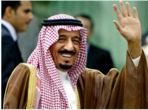
Salman bin Abdulaziz Al Saud left

The U.S. regime wants fracked U.S. natural gas to fill an increasing portion of Europe's needs, and for natural gas from U.S.-allied fundamentalist Sunni royal regimes to fill as much of the rest as possible, so as to squeeze-out the existing top supplier, Russia . (Until recently, the plan was for U.S. ally Qatar, owned by the Thani royal family, to become Europe's main supplier, via pipelines which would traverse through Syria, for which reason Syria needs to be conquered (so that those pipelines through Syria can be built, perhaps even by American firms). However, the Saudis, who usually run U.S. foreign relations — often with assistance from the Israeli regime, which is far more popular in the United States and also in Europe (and thus serves as the Saudis' agents in the U.S. and Europe) — have now blockaded Qatar because of Qatar's insufficient compliance with the Saudis' demand for total international isolation of Iran and of any other nation where Shia are or might become dominant. (For example, the Saudis bomb Yemen to impose fundamentalist Sunni leadership there and kill the Shia population.) And, so, now, after the break between Saudi Arabia and Qatar, even more than before, the main beneficiaries of cutting off Russian gas-supplies to the EU would be U.S. fracking companies.